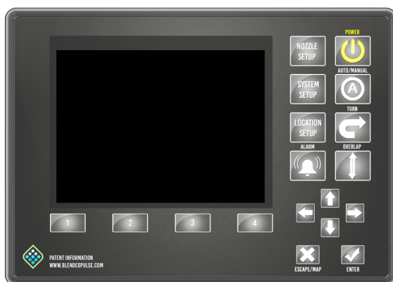
PinPoint™ II CapView II