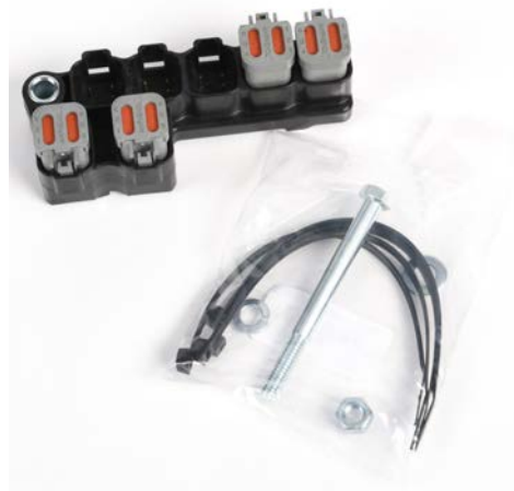
CAN Expansion Kit 729500

Existing SpeedTube & insecticide systems using the Y harness (729288 kit) are compatible with Expansion Hub if the grower is adding vApply HD. The Y cable will plug into the Expansion Hub using a single CAN Jumper to connect the Y to the Expansion Hub instead of the Y cable plugging into the vDrive plug.