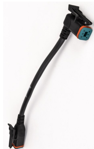
Black Row CAN Jumper

Refer to the next page for Expansion Hub mounting locations and recommended jumper cable lengths.