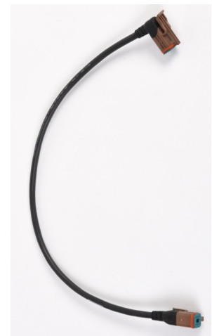
Brown Row CAN Jumper